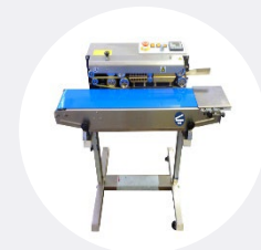
Option: Stainless Steel Stand (Horizontal Only)