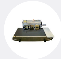
Option: Extra Wide Conveyor